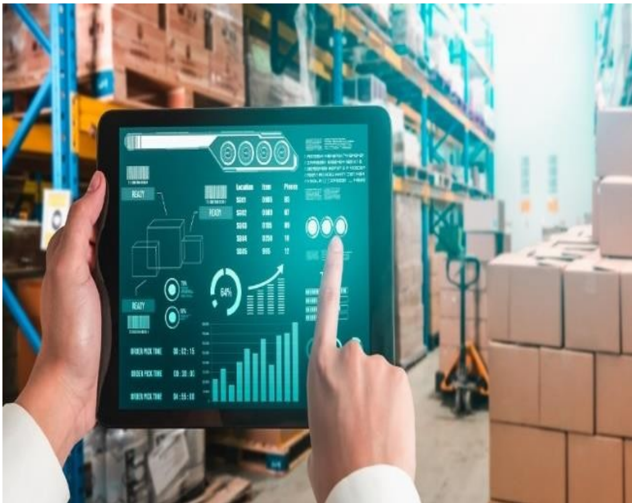
Fig 2: Smart Inventory Monitoring

The illustration depicts a contemporary warehouse setup with an intelligent inventory management system. A mobile device is showing a real-time data analysis of the stock, movement, and metrics of the products. The system employs technologies like IoT sensors, RFID, and barcode scanning to gather and update inventory information.