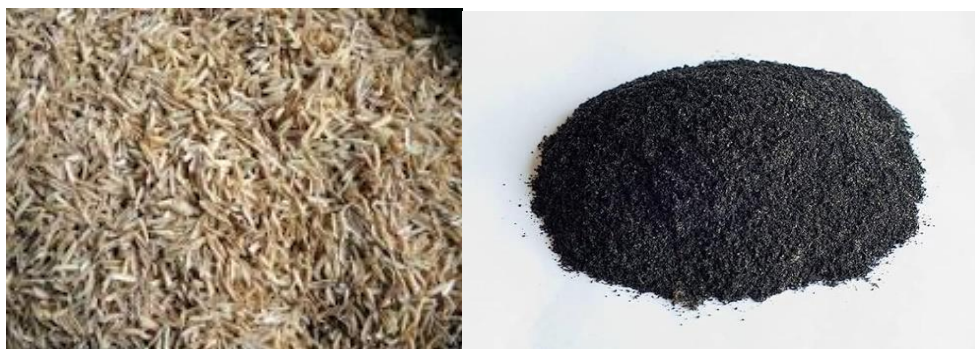
Fig 1: RHA as received and after burning at 700 °C