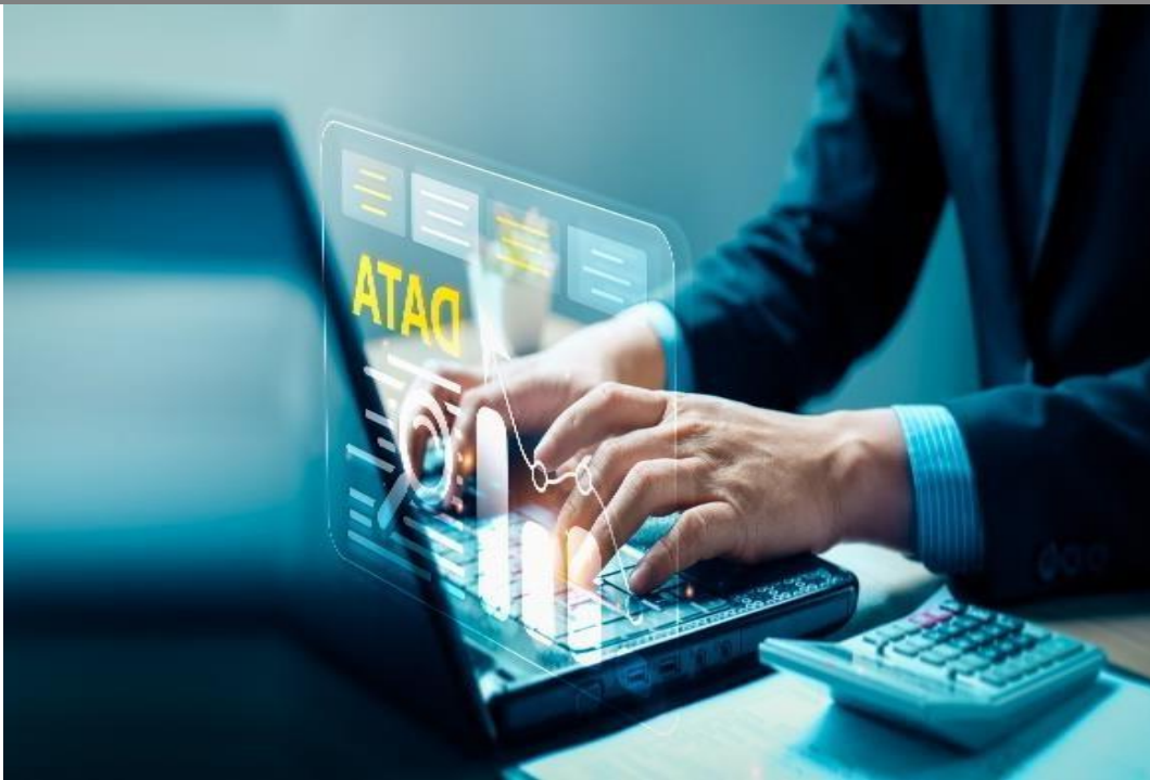
Fig 3: Inventory Data Analysis

The figure shows the application of data analytics in inventory management on a digital platform. It integrates massive inventory data and visualises it with graphs, charts and forecasts. This allows for the effective assessment of inventory levels, demand, and performance.