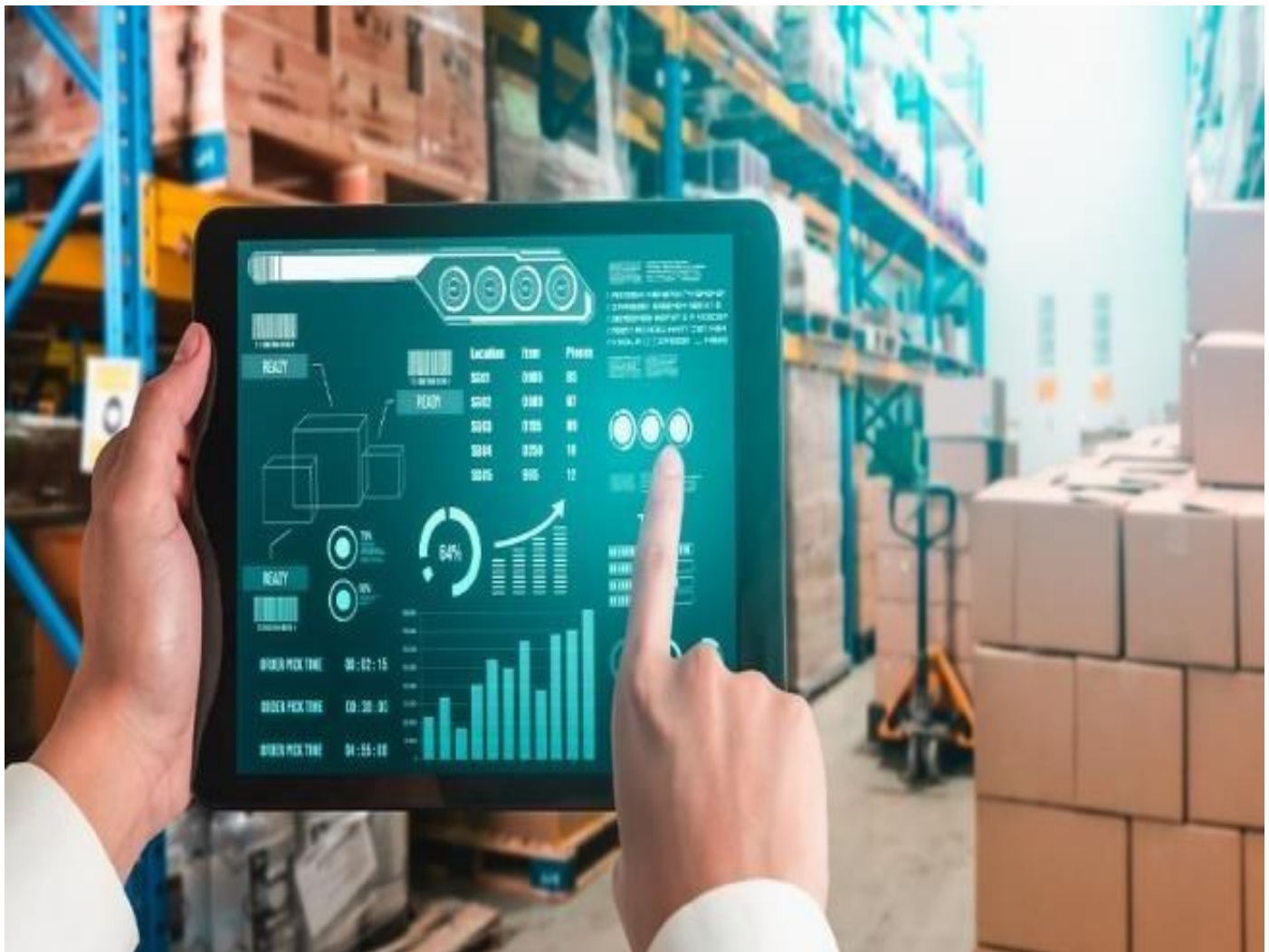
Fig 2: Smart Inventory Monitoring

The illustration depicts a contemporary warehouse setup with an intelligent inventory management system. A mobile device is showing a real-time data analysis of the stock, movement, and metrics of the products. The system employs technologies like IoT sensors, RFID, and barcode scanning to gather and update inventory information.