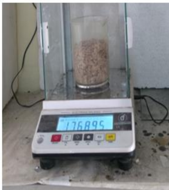
Picture 2: Crushing of Pistachio Shells & determination of the weight